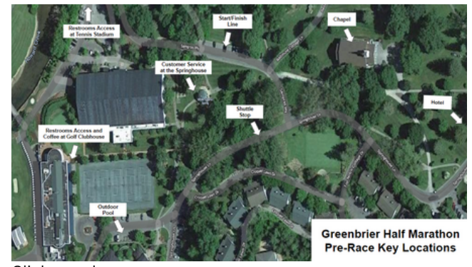
Click to enlarge.

Shuttles are not needed for guests staying at the Greenbrier. They can simply walk down to the start/finish line from the North Entrance of the property.